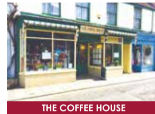
THE COFFEE HOUSE