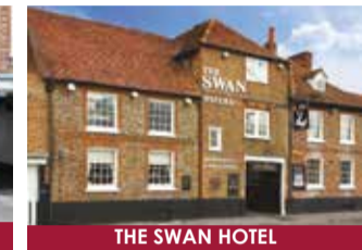
THE SWAN HOTEL