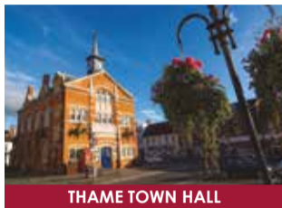
THAME TOWN HALL